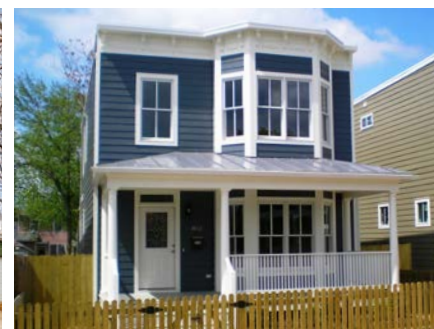
A sampling of some of the nearly 250 affordable homes that project:HOMES has built and sold throughout Richmond, Chesterfield, Henrico and Petersburg